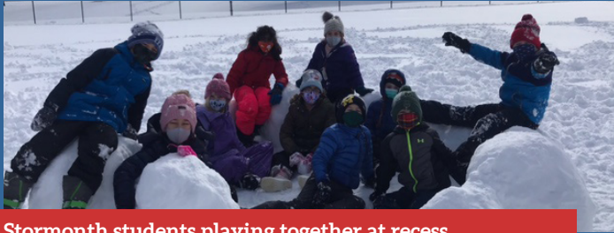
Stormonth students playing together at recess

Recently I was asked while giving a prospective family a tour, "What sets Stormonth apart from all of the neighboring schools?" My immediate response was the kindness displayed within our school walls. Let me explain. Our teachers and staff work hard to instill not only a strong academic background and a love of learning within our students, but they work equally as hard at fostering good citizenship and kindness toward others that will support students as they become college and career ready.