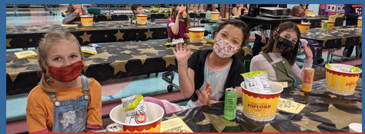
Stormonth students celebrating the premier of Super Happy Awesome News