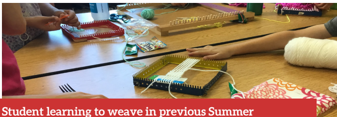
Student learning to weave in previous Summer Pathways session

If you are interested in joining this focused and engaged board, please visit https://fpbedfoundation.org/get-involved