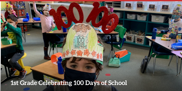
1st Grade Celebrating 100 Days of School