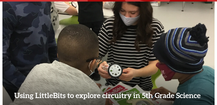
Using LittleBits to explore circuitry in 5th Grade Science