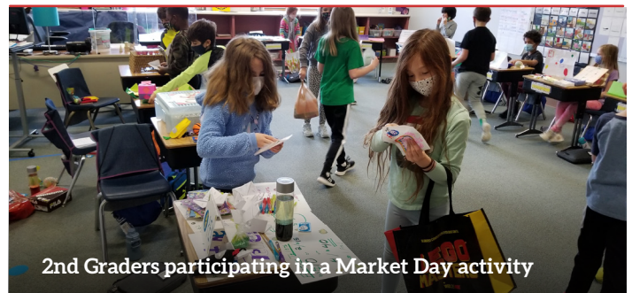
2nd Graders participating in a Market Day activity