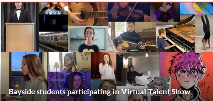
Bayside students participating in Virtual Talent Show