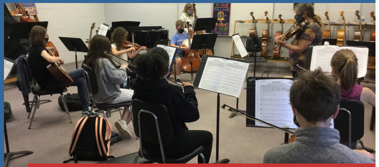
Orchestral music returns to in person instruction at Bayside